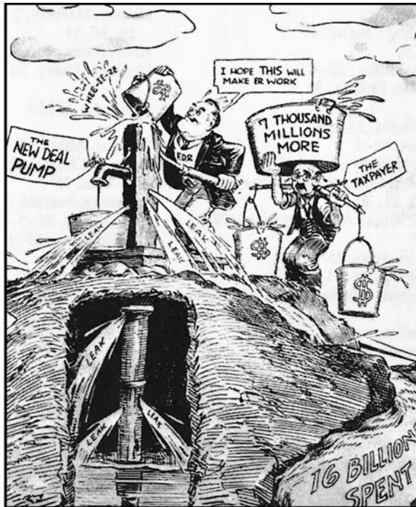
An American cartoon about Roosevelt's New Deal.